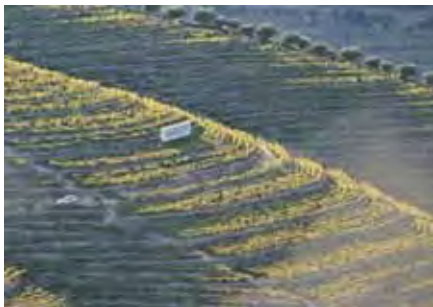
QUINTA DO RETIRO ANTIGO OLD VINEYARD

Then came the complications as in other areas of Europe; June was damp, with 68 mm of rain, the norm being 24 mm. July was no wetter than usual but it was cooler than usual, so the fungal risk continued and veraison came quite late. Our viticultural team had to work very hard through June and July to keep the grapes safe and in good condition. Leaf growth was vigorous, so we had to remove many leaves to allow for better aeration and prevent fungal infection. These were very challenging weeks.