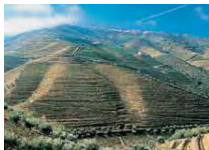
QUINTA DO RETIRO ANTIGO