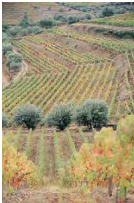
QUINTA DA CAVADINHA

All of the Warre 2007 Vintage Port was made in lagares and just 3,000 cases (49 pipes) will be released for sale in 2009. This is less than 10% of the combined total production of the three Warre estates: Cavadinha, Retiro Antigo and Telhada in 2007.