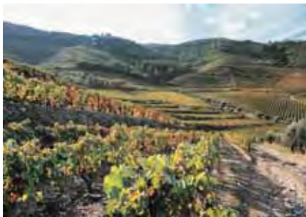
QUINTA DA CAVADINHA VINEYARD

The winter rain is vital to sustain the vines through the Douro summer which can be extreme. The early months of 2007 were drier than normal and would have compromised the wines if it had not been for the earlier rain. These months were also warm and the vines reacted accordingly with budburst two weeks early at Cavadinha on March 15th. Flowering took place on the 18th May and fruit set on the 22nd, both taking place during cool and damp weather, so reducing yields somewhat.